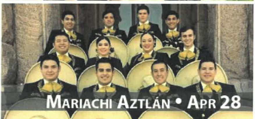
MARIACHI AZTLÁN • APR 28