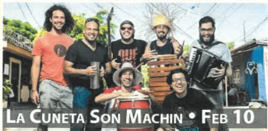
LA CUNETA SON MACHIN • FEB 10