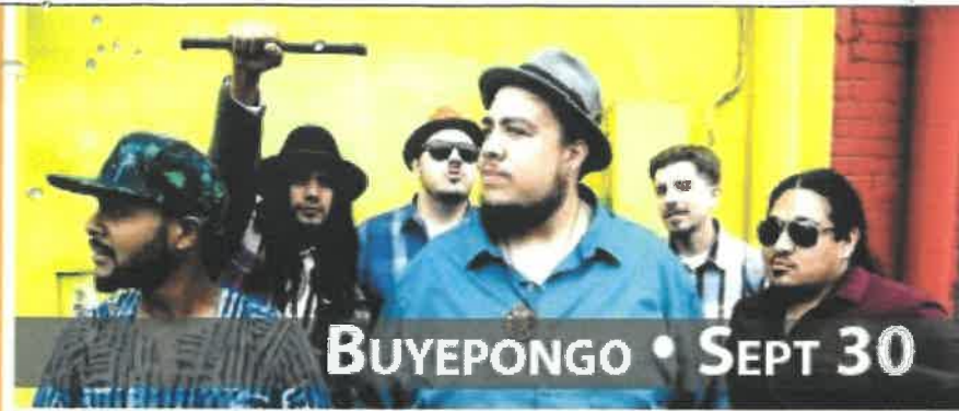
BUYEPONGO • SEPT 30