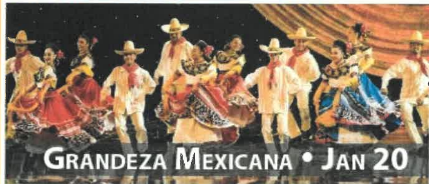
GRANDEZA MEXICANA • JAN 20